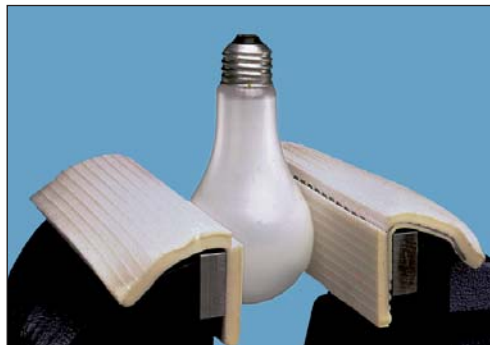
Royal "Magic/Grip" liners securely hold any fragile parts or objects without marring.