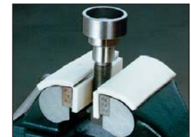
Holds on threads without damaging them.